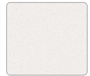
A80SMA White Ice