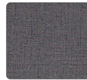
DT 65 Grey Fabric