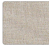
DT 63 Rough Fabric

For AUTOMATIC DOORS and IDEA and SMART cars