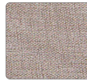
DT 64 Kaki Fabric